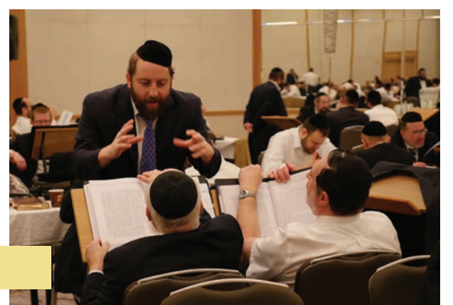
At last year's Shivti Yarchei Kallah.